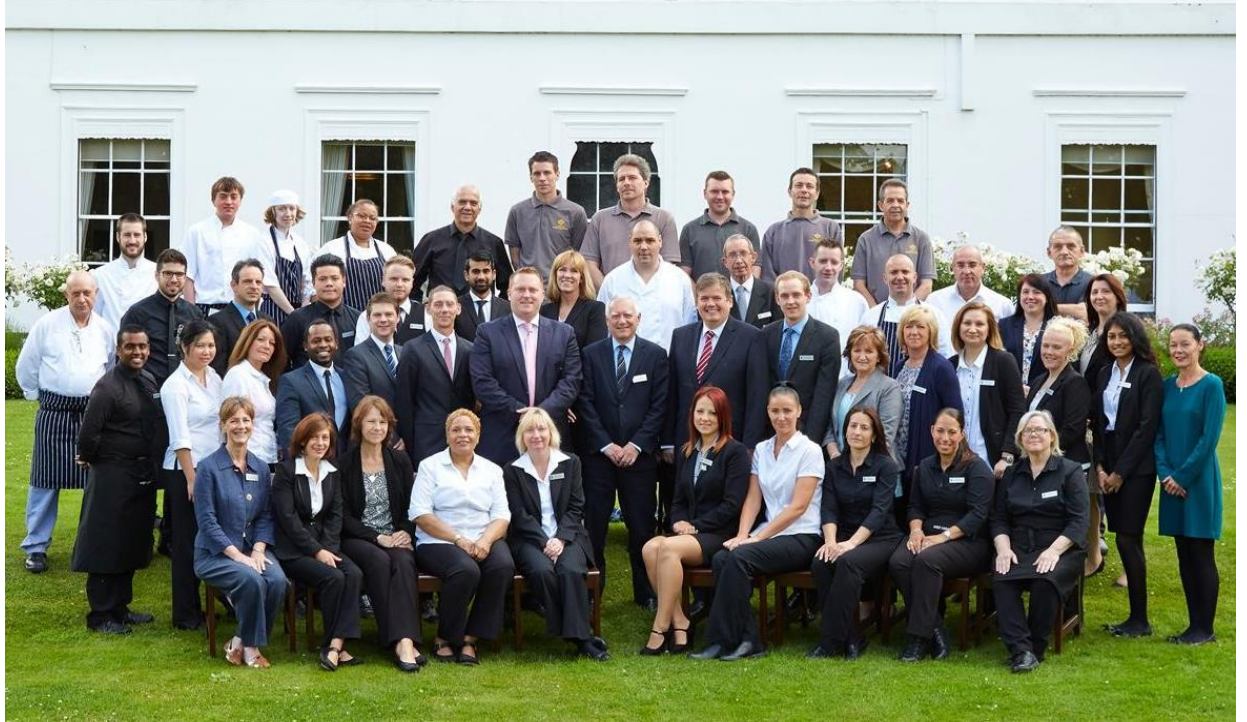
BEALES HOTEL STAFF PHOTO – June 2016