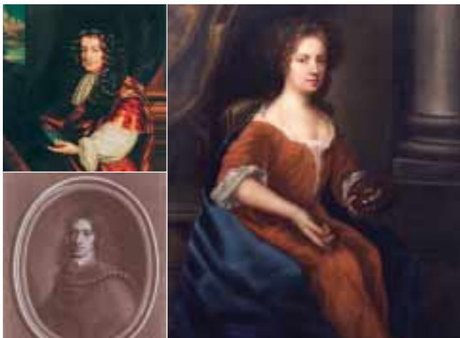
"The Jewel in the Grounds", London Evening Standard.

In 1557, when Queen Elizabeth I was living at the Bishops Palace at Hatfield, it is recorded that she was escorted to West Lodge by a retinue of twelve ladies in white satin. On entering the Enfield Chase, she was met by fifty archers in scarlet boots and yellow caps, armed with gilded bows.