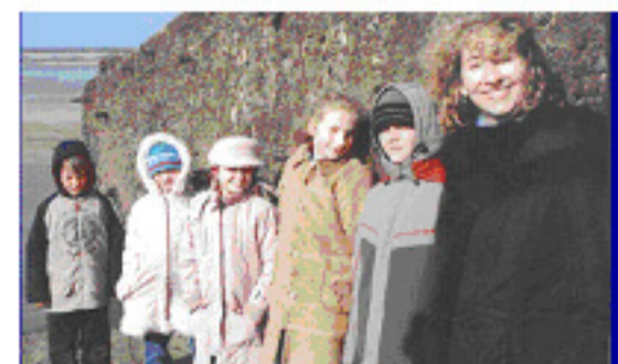
9th Generation? (3 children, 2 step-children, 5 first cousins – all aged from 14 down to 1!)

For more information please contact andrewbeale@bealeshotels.co.uk or sally.brett@bdo.co.uk